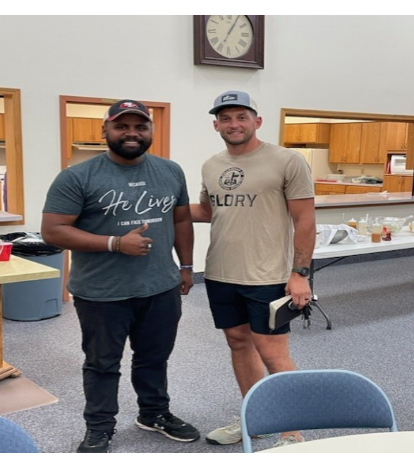
FCA Summer Camp