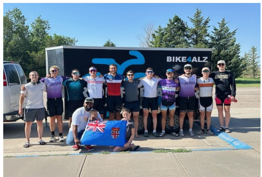
2025 Bikers4Alz group